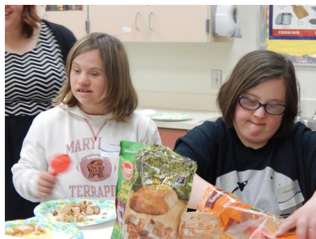
Young adults take a cooking class with the staff of Accessible Resources for Independence .