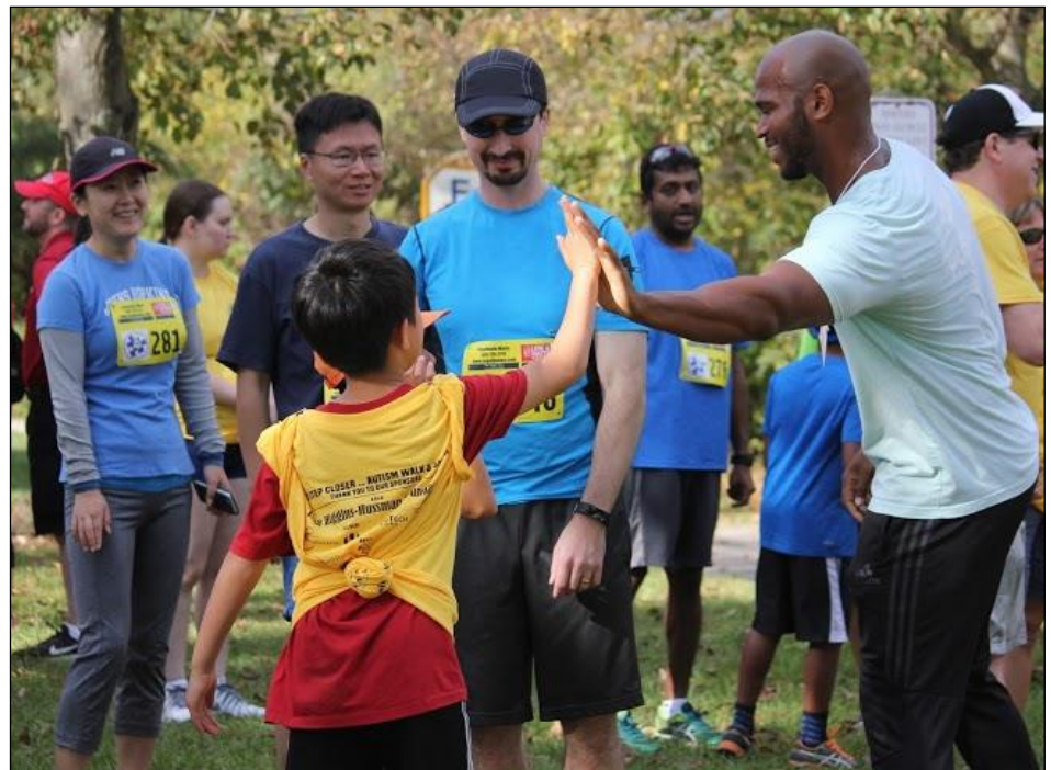
Hundreds of walkers, runners, volunteers, families, and supporters joined HCAS for its 11th Annual One Step Closer Autism Walk & 5K Run.